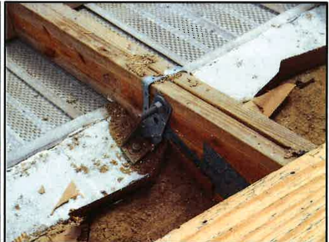
Double Truss Connection