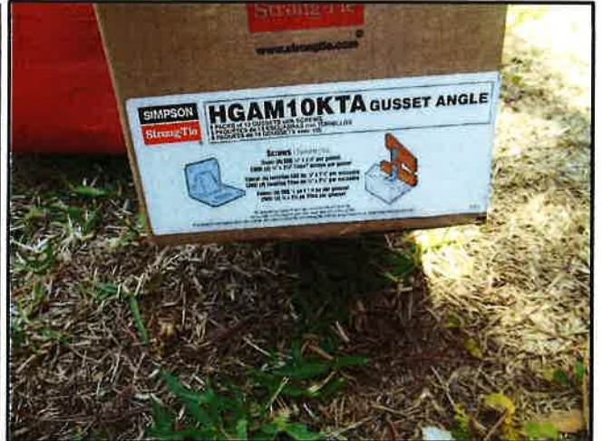
Truss to Wall Reinforcement