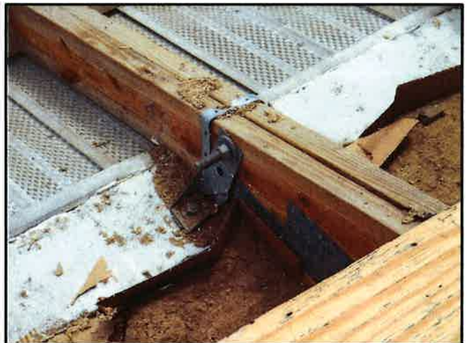
Double Truss Connection