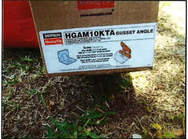
Truss to Wall Reinforcement