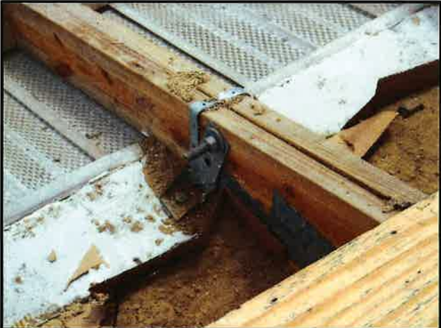
Double Truss Connection