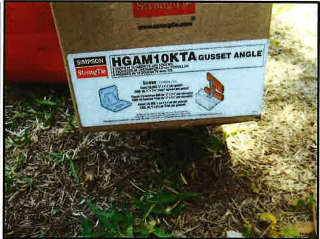
Truss to Wall Reinforcement