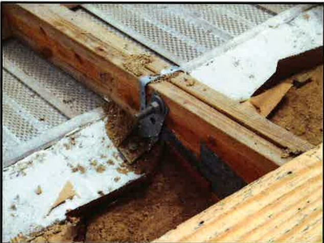
Double Truss Connection