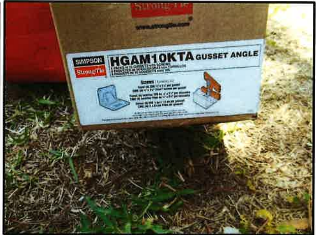
Truss to Wall Reinforcement