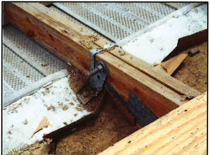
Double Truss Connection