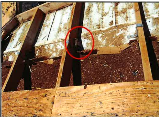
Truss to Wall Reinforcement