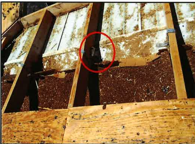
Truss to Wall Reinforcement