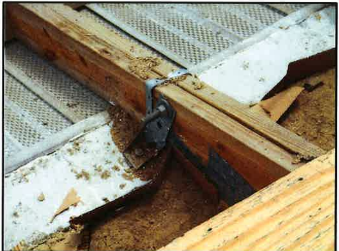
Double Truss Connection